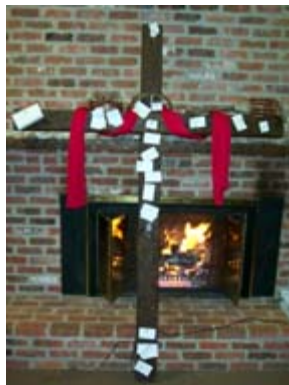
Photo of the cross, with the “nailed clinical sheets”, made during an encounter of G12

Pay close attention: The sins are nailed on a cross, in a tangible, modern cross, on a cross that is not the one of Christ... on a false cross!