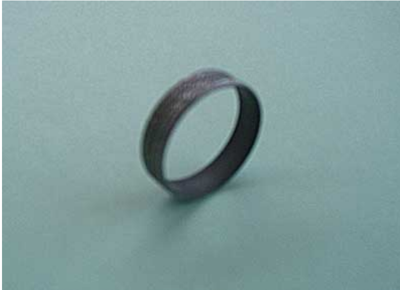
"The wedding ring of "being married with Christ"