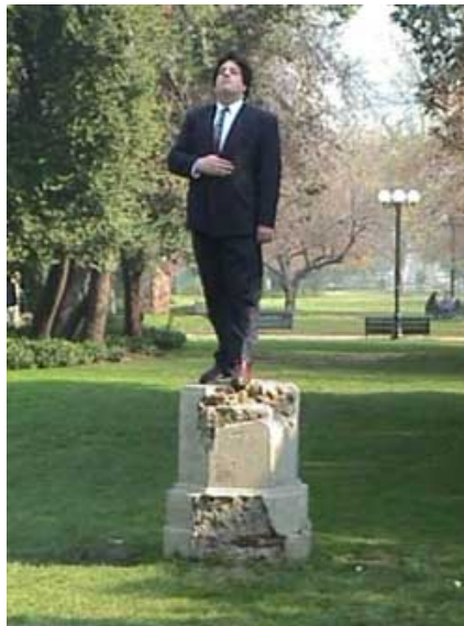
"Raised on high pedestals, only in their imagination, of course"

Those leaders , not servants, are no longer what they used to be, which is to say, truly humble, accessible, transparent, long suffering and teachable (Titus 1: 7-9). No, now, having been raised into their imaginary and untouchable pedestals of religious infallibility, they strut around in front of all with their alleged superiority, sheltered in arrogance, showing off the beautiful colours and sumptuous ethereal of their feathers, as the especially elected, to lead their coreligionist subjects. Any questions that these subjects may ask them, is seen as a sign of rebellion.